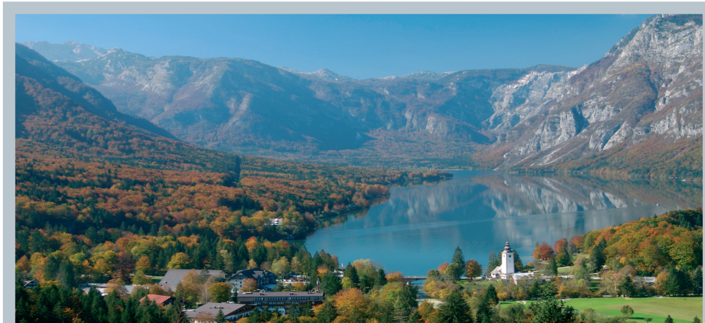
APRISA XE PROVIDES HIGH CAPACITY NETWORK FOR VIDEO OVER IP SURVEILLANCE CAMERAS IN THE KARST REGION OF SLOVENIA

Fires are one of the biggest threats to the wellbeing of Slovenia's forests: in 2003 alone, 65 fires ravaged an area of approximately 2,000 hectares. When the Government of Slovenia decided to implement an early warning 'fire watch' system for early detection and response, they needed a solution that provided carrier-class availability for the real-time mission-critical application. The Aprisa XE point-to-point microwave radio from 4RF Communications was the only product that could meet the demands of the application, and the Aprisa XE network now covers an area of more than a thousand square kilometres.